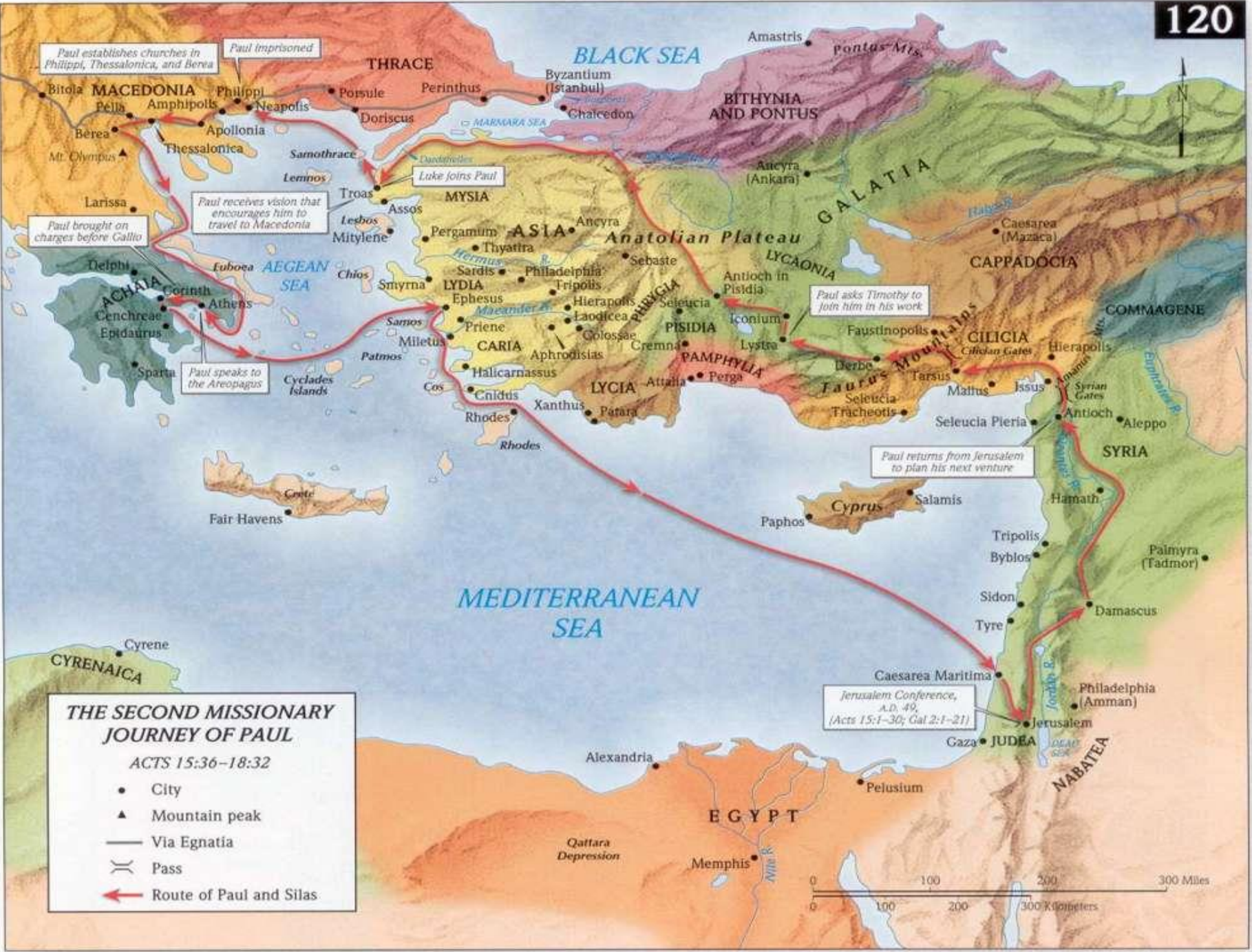
THE SECOND MISSIONARY JOURNEY OF PAUL ACTS 15:36-18:32 • City ▲ Mountain peak — Via Egnatia ⌋ Pass ← Route of Paul and Silas

Jerusalem Conference, A.D. 49, (Acts 15:1-30; Gal 2:1-21)