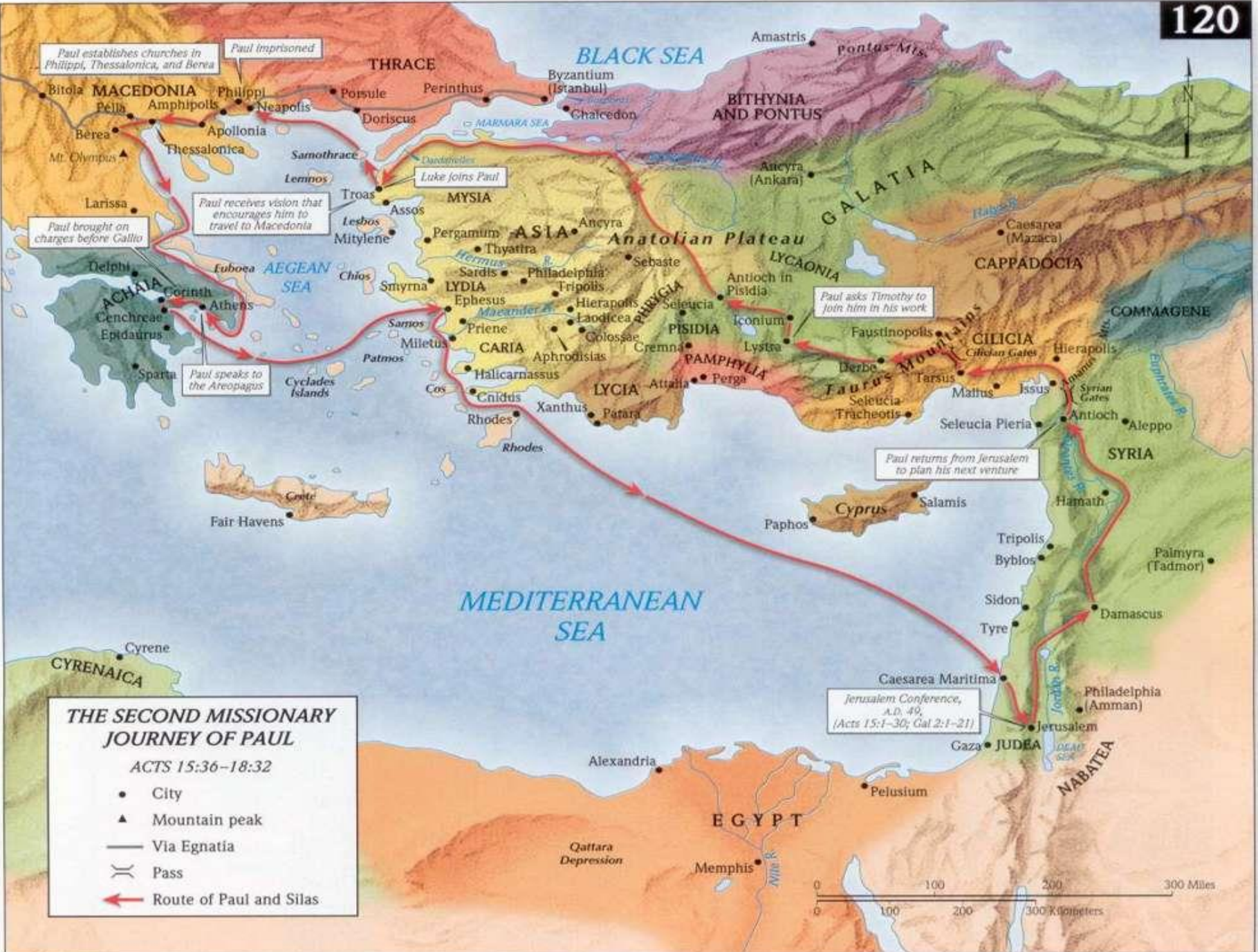
THE SECOND MISSIONARY JOURNEY OF PAUL ACTS 15:36-18:32 • City ▲ Mountain peak — Via Egnatia ⌋ Pass ← Route of Paul and Silas

Jerusalem Conference, A.D. 49, (Acts 15:1-30; Gal 2:1-21)